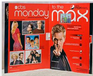
Small, paper-thin, video screen capable of playing a short video