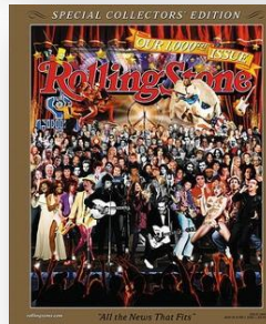
The image appears 3-D when you look at the page from different angles