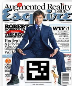
Hold a special scan code (QR Code) in front of a webcam to trigger specific actions, e.g. play a video; and much more (click on image to the left to learn more)